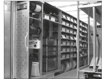
ES-1000 Driver's side shelving