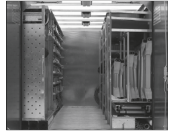
ES-1000 Rear view