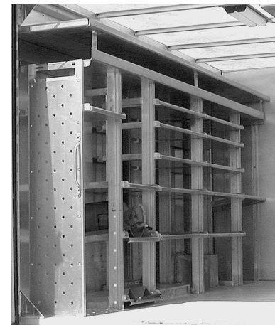
Adjustable shelving; driver side (2) full length top shelves shown

Close-out panel in rear of cab Separate cab and body—remountable design